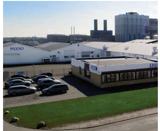
Paxxo was founded in 1980 based on making continuous liners.

We offer the Longopac for Dust in several different strengths and three different formats: Maxi, Midi and Mini. We also offer with guaranteed levels of anti-stat for ATEX environments.